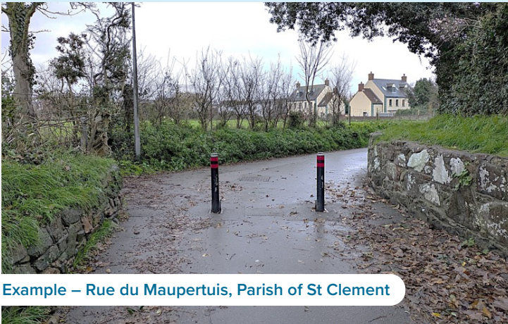
Example – Rue du Maupertuis, Parish of St Clement

The proposed traffic restriction will share similarities with an existing scheme on Rue du Maupertuis. This scheme, delivered in 2020 (following a one-year trial) introduced traffic bollards shown in the photograph below on Rue du Maupertuis and led to 77% of Le Rocquier students using the route feeling safer when travelling to and from school.